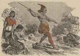
Kiodago at the Fishing Station.

Chevalier de Grais, the former having the chief command of the expedition, were sent upon this duty, with Hanyost to guide them to the village of Kiodago. Many hours were consumed upon the march, as the soldiers were not yet habituated to the wilderness; but just before dawn, on the second day, the party found themselves in the neighborhood of the Indian village.